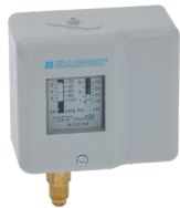
LF Code: 3320278 GEV Code: LF3320278