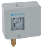
LF Code: 3320283 GEV Code: LF3320283