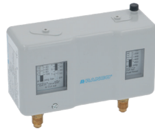
LF Code: 3320271 GEV Code: LF3320271