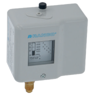
LF Code: 3320273 GEV Code: LF3320273