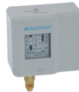
LF Code: 3320281 GEV Code: LF3320281