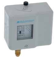
LF Code: 3320282 GEV Code: LF3320282