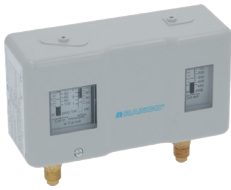
LF Code: 3320270 GEV Code: LF3320270