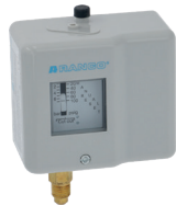
LF Code: 5157973 GEV Code: LF5157973