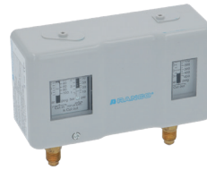
LF Code: 3320272 GEV Code: LF3320272